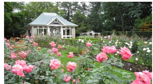
Fellows Riverside Gardens

End your day at Mastropietro Winery . Enjoy wine tastings in a beautiful setting. Group-friendly dining for your group can also be arranged.