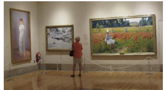
The Butler Institute of American Art

Visit the Youngstown Historical Center (Steel Museum) for a unique look into the steel industry and how it shaped the Mahoning Valley. Enjoy a delicious treat from Handel's Ice Cream on the way home. A Youngstown tradition!