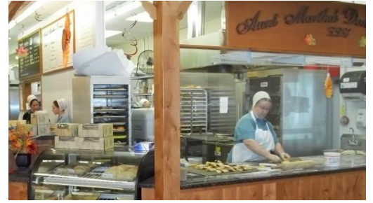
The Amish Market

Begin the next day at White House Fruit Farm and enjoy all this fantastic Ohio Century Farm Market has to offer. Take home a box of their famous blueberry donuts!