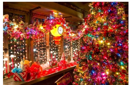
Memories of Christmas Past

Enjoy an evening holiday performance at the Best Western Plus Dutch Haus Inn & Suites Dinner Theater . Then enjoy one million holiday lights in 80 animated light scenes at the drive-through Joy of Christmas Holiday Light Show . Stroll through the Gingerbread House and view hundreds of homemade gingerbread house displays. Stop by the Ice Castle for entertainment, and Santa!