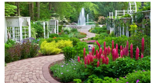
Fellows Riverside Gardens