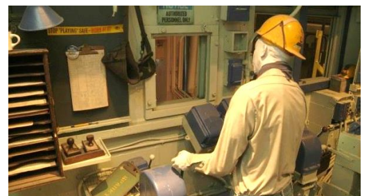
Youngstown Historical Center