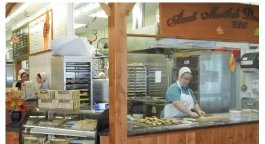
The Amish Market