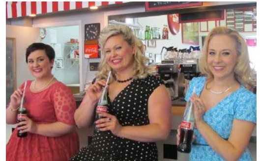
Best Western Plus Dutch Haus Inn & Suites Dinner Theater