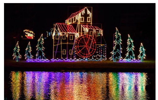
Joy of Christmas Holiday Light Show